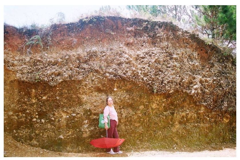
Figure 2: Example of a road cut at Mount Salat, Sitio Sagapa, Brgy. Palaypay, Kapangan, Benguet. Notice thin topsoil interspersed with 20-30cm Layer A zone, 20-50cm Layer B regolith. 600cm± Layer C is mother rock (Photo taken in 2008)

Based on previous fieldworks conducted by the author in the Benguet highlands (Kapangan, Kabayan, Tuba, Sablan) from 2008-2012, there is either a thin (20cm if at all) or an absence, of a cultural layer that may contain artefacts (see topsoil interspersed with Layer A in Figures 2 and 3). This is brought about by the erosional process that is at work especially during the semi-annual rainy season from May to November. Therefore, one would expect artefacts to be in motion on the surface rather than within the stratigraphic layers.