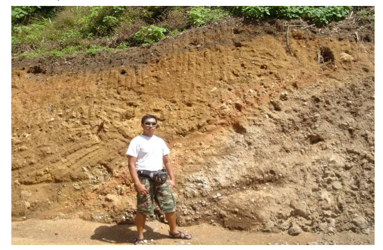
Figure 3 : Example of a road cut at Mount Kabuyao, Sitio Poyopoy, Brgy. Taloy Sur, Tuba, Benguet. Notice thin topsoil interspersed with 20-30cm Layer A, 20-50cm Layer B is regolith. 300-500cm Layer C is mother rock (Photo taken by author April 2012)

Figure 2: Example of a road cut at Mount Salat, Sitio Sagapa, Brgy. Palaypay, Kapangan, Benguet. Notice thin topsoil interspersed with 20-30cm Layer A zone, 20-50cm Layer B regolith. 600cm± Layer C is mother rock (Photo taken in 2008)