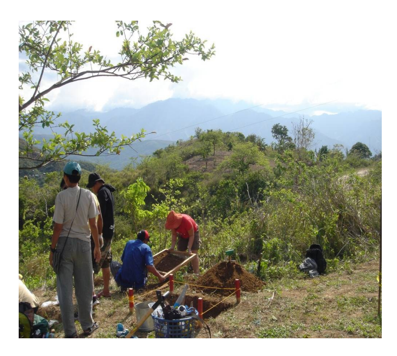
Figure 4: Team members of ISAP 2 excavating a 1x1 Test Pit at a Mountain in Brgy. Patiacan, Quirino, Ilocos Sur. Hundreds of artefacts were found on the surface of the Minlaoi Open Site (National Museum Code I-2012-M).

On another occasion during fieldwork lead by the author in the tri -boundary of the provinces of Ilocos Sur (highland), Abra, and Mountain Province, the team opened a test pit at a mountain slope. The 1m x 1m test pit was opened at Minlaoi open site in Barangay Patiacan, Quirino, Ilocos Sur (Figure 4). Top soil to Layer A was observed between 10 to 20 cm below surface. Layer B is regolith or weathering mother rock. Layer C is intuitively the mother rock. This particular site was heavily laden with surface finds comprising of ceramics, and metal implements (Canilao 2012).