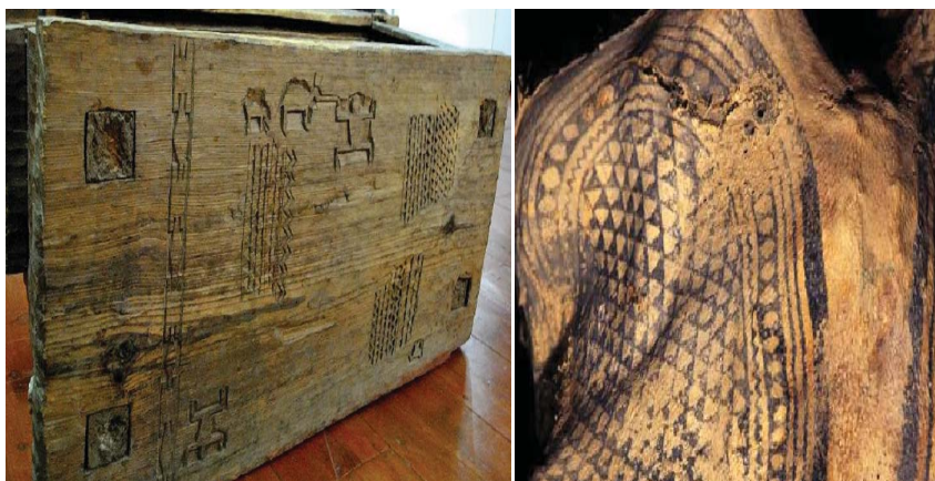
Figures 7-8: A rectangular wooden coffin possibly used for kinship internment. This coffin is found at the Kabayan Museum in Benguet. Right: The coffin has intricate tattoo patterns similar to the tattoo patterns found on the Kabayan mummies.

lines and dots, but forming circles, serves as the base for the decoration of the legs and arms." The ever-present to-o , or man motif (see Figures 6-7), shows how the Ibaloi views himself as a prime element within the context of his existence and reality. The oleg , or snake, signifies the essence of animism in Ibaloi culture and the belief in spirits, the soul, and life after death. 14 Traditional tattooing designs have survived. Many of these have also been appropriated in contemporary tattoo practice, in different mediums as part of the modern way of (re-)expressing social and individual identity.