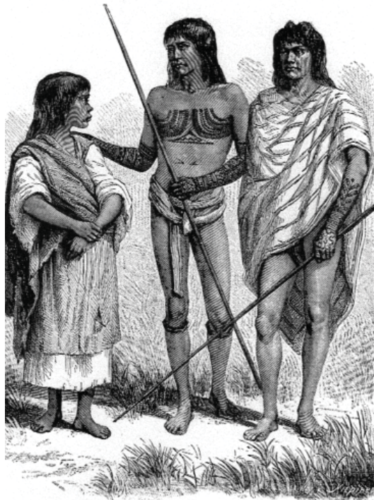
Types d' Igorrotes

Figure 3: Types D' Igorrotes (Types of Igorots) from Alfred Marche 1887, Lucon et Palaowan (Six Annes aux Philippines) , p. 153.