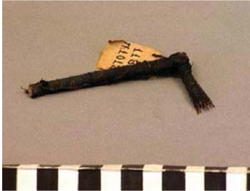
Figure 11: A Bontoc tattoo instrument with ten steel needles attached to a stick.

placed against the skin and driven in by a stroke with a wooden hammer. When about twenty strokes have thus been made, the wounds were rubbed vigorously with soot. The soot was obtained by burning resinous wood, and a pot was held over the flames to collect the soot (134).