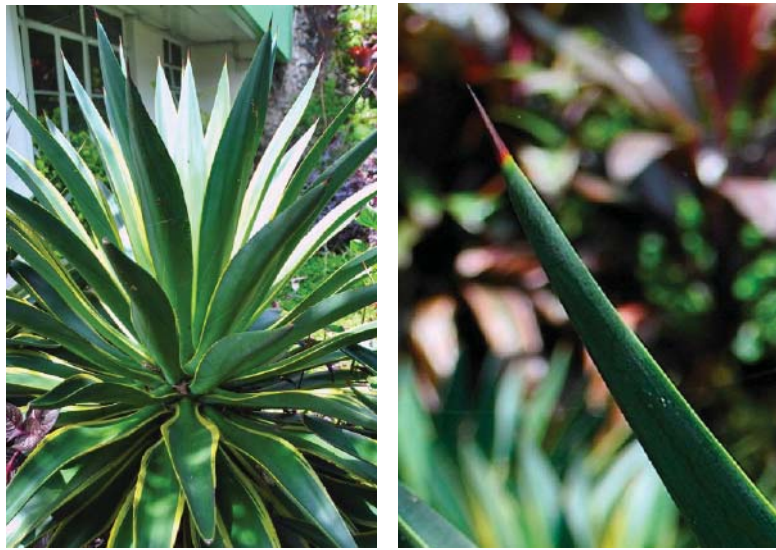
Figures 9-10: The cactus plant (locally referred to as maguey ) is abundant in Benguet. It grows on rocky portions of the mountains and is grown in some gardens in Adaoay and Kabayan Benguet. Left: A thorn from the maguey plant used for tattooing in Benguet (Photograph by AV Salvador-Amores, 2012).

Mummies, according to Merino, were tattooed using the thorns of the cactus plant maguey ( Furcraea foetida L. ), which is abundant in the Kabayan, Bokod and other areas in Benguet (Figures 9-10). This tattooing “needle” was dipped into the ink and was used to puncture the skin with the desired designs. Ursula Perez writes that the “sharp instrument may also be a thorn of lemon or orange trees” (11). Merino (27) adds that the art of tattooing among the mummies of Kabayan was done with the use of “pounded leaves of a native tomato mixed with soot and water until a consistent and oily ink-like liquid is produced.” According to some tattooed elders in Kabayan, the colour of the tattoo is bluish and greenish black. “The solution, which serves as a coloring and healing lotion, is applied after the arms are pricked with sharp instruments following a desired design” (Perez, U. 11).