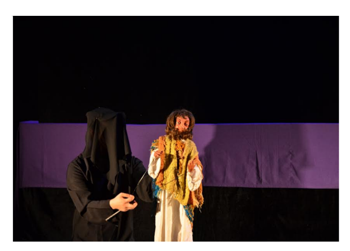
Figure 6. Judas

The next act, "Huwebes Santo" (Maundy Thursday), Lapeña-Bonifacio squeezed three important events in the passion narrative in ten minutes: the Last Supper (See Figure 7), the garden of Gethsemane (See Figure 8), and the capture of Christ. A highlight of this act is the appearance of the huge devil puppet, which tempts Christ during the prayer in Gethsemane to be saved from the call of the cross.