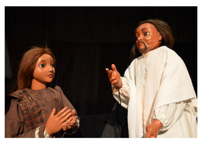
Figure 5. Magdalena

In the second act, "Lunes Santo" (Holy Monday), the same child introduces the very first encounter of Jesus with the high priests. The child narrates that this encounter was due to the uncontrolled temper that Jesus had when he saw the temple transformed into a market place. The third act is titled "Martes Santo" (Holy Tuesday). As in the previous acts, the title is also flashed onscreen. Like other sinakulos , the introduction of Mary Magdalene is a very important aspect of the narrative (See Figure 5). Following the story in the Gospels, Mary Magdalene is introduced as the adulteress. In this performance, Mary Magdalene is introduced as a sinner. This, perhaps, is due to the fact that the audience is mostly children. But what is important in this act is the presentation of the transformation of Magdalene from a sinner to a disciple. From here onwards, Mary Magdalene is seen to be one of the chosen few of Jesus, similar to the dramatizations presented in many sinakulos .