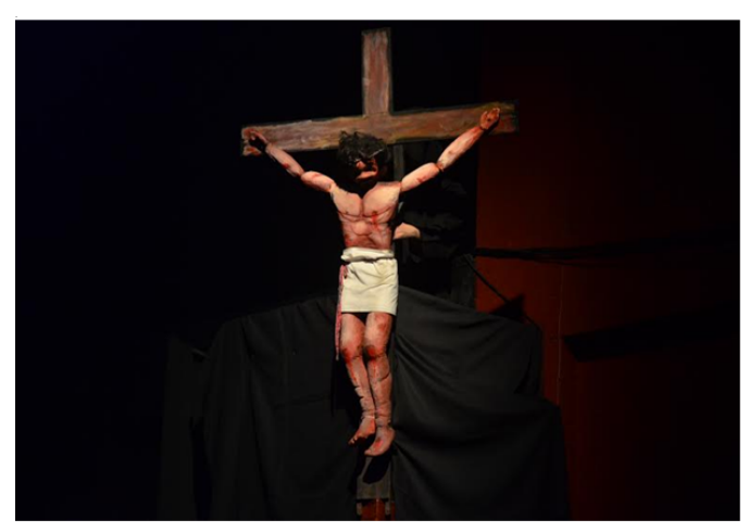
Figure 9. Crucified Christ