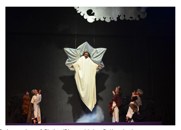
Figure 10. Ascension of Christ

Despite the foreign origins, the company has already created an assemblage of tradition that may now be considered a part of Philippine puppet culture. In the case of Teatrong Mulat, puppets inspired by the bunraku tradition are also manipulated not only by males but also by female puppeteers. In Papet Pasyon , most puppets are bunraku -inspired. Female characters (e.g. Mary and Mary Magdalene) are usually manipulated by female puppeteers while male characters (e.g. Jesus and his apostles) are manipulated by male puppeteers. However, there are also female puppeteers who manipulate male puppets (e.g. Jesus and