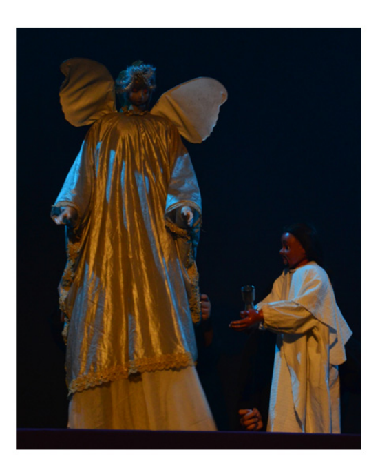
Figure 3. Angel with Jesus Christ from Papet Pasyon

and Si Arao at si Bulan (1983, Sun and Moon). In these plays, puppets were painted on a plastic sheet using acrylic paint. The cut-outs were then supported using umbrella rods. With the use of translucent material, the colors came out easily on the screen.