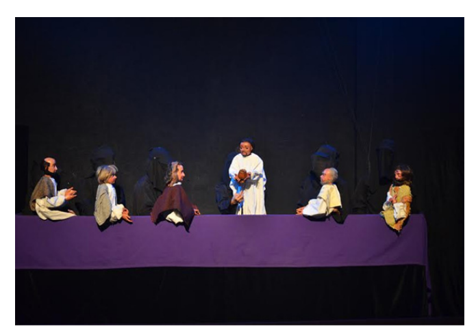
Figure 7. Last Supper

The next act, "Huwebes Santo" (Maundy Thursday), Lapeña-Bonifacio squeezed three important events in the passion narrative in ten minutes: the Last Supper (See Figure 7), the garden of Gethsemane (See Figure 8), and the capture of Christ. A highlight of this act is the appearance of the huge devil puppet, which tempts Christ during the prayer in Gethsemane to be saved from the call of the cross.