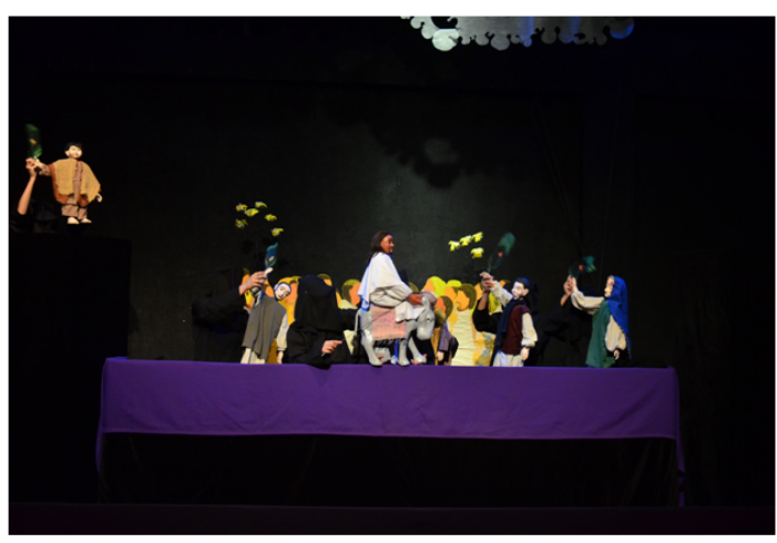
Figure 4. Jesus' Entry to Jerusalem

But then this child-narrator remembers something upon seeing Domingo de Ramos flashed on a white screen downstage right. He slowly reads the words projected and begins singing the song "Pagsalubong kay Hesus" (Jesus is Welcomed). In this sense, the first act is primarily the victorious entrance of Jesus in Jerusalem, which, in the Gospels and in popular pasyon , is the beginning of the passion narrative (See Figure 4).