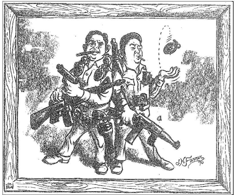
Figure 6. "Portraits of senator and congressman as warlords."

to accomplish something unprecedented in the history of the Philippine Republic: reelection. During the 1969 campaign, Marcos stumped vigorously, reaching even remote villages to personally place a check for PHP 2,000 in the hands of each barrio captain, obligating them, within the country's political culture, to use every possible means to deliver a winning margin. This strategy cost the Marcos campaign an estimated USD 50 million, far more than the USD 34 million Richard Nixon had spent to win the US presidency just a year earlier (Bonner 1987, 76–77). In the aftermath of this costly flood of cash, the Philippine peso lost half its value, government services were slashed, and the economy contracted (Thompson 1995, 34–35; Noble 1986, 79–80).