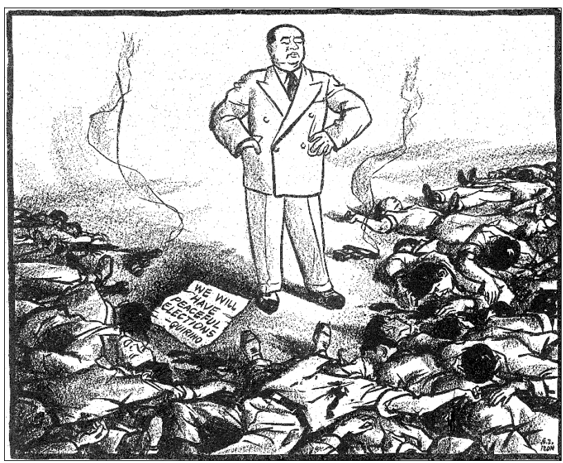
Figure 2. "Peaceful election!"

captured in a cartoon from the Philippines Free Press (September 17, 1949, 1).