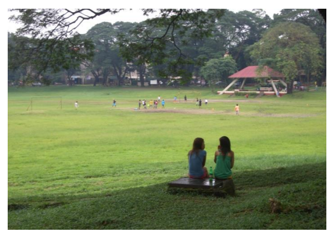
Figure 6. The Sunken Garden provides opportunities for both passive and active recreation as it provides both a large open field for sports activities and vantage points for spectators.