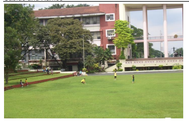
Figure 7. A few users engaged in both passive and active recreation are observed at the U.P. Amphitheatre in comparison to the Academic Oval and Sunken Garden.