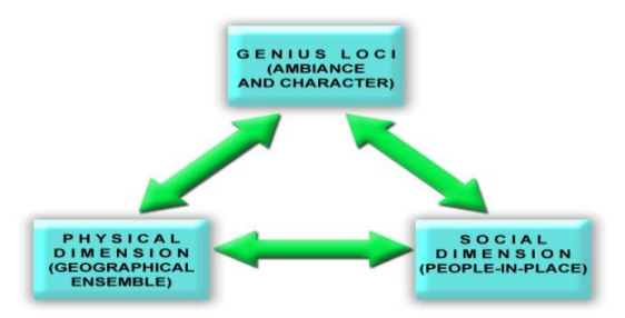
Figure 4. The People-Place Triad.