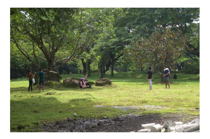
Figure 8. Passive recreation is generally observed at the U.P. Lagoon area.