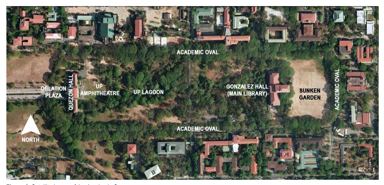
Figure 2. Satellite Image of the Academic Core.