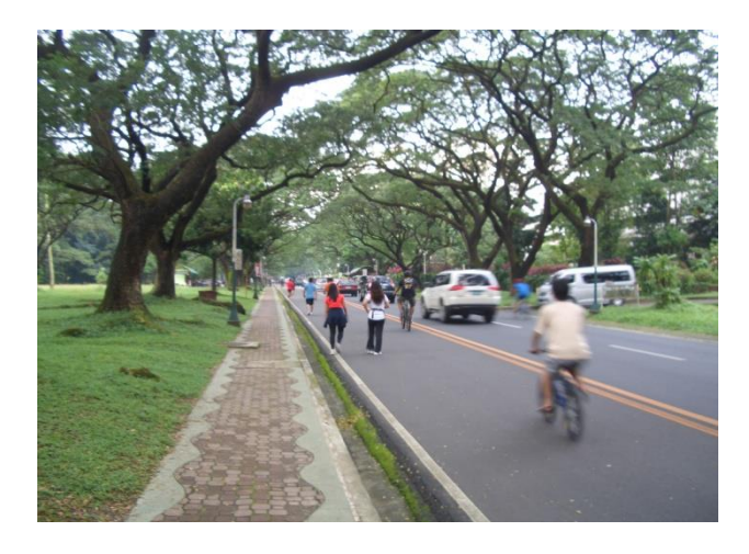
Figure 5. Active recreation of biking and jogging are commonly observed at the Academic Oval.

Photos were taken to capture the different kinds of activities done at the Academic Core. Two Tuesdays and a Friday were chosen to represent the weekdays and a Sunday to represent the weekend for days of photo documentation. It is observed that most users can be seen at the Academic Oval, whether for active or passive recreation. The Sunken Garden also has a notable number of users. This may be due to the fact that the Sunken Garden is adjacent to the Academic Oval with no physical or visual barriers between the two spaces and that there is a transport hub adjacent to the area.