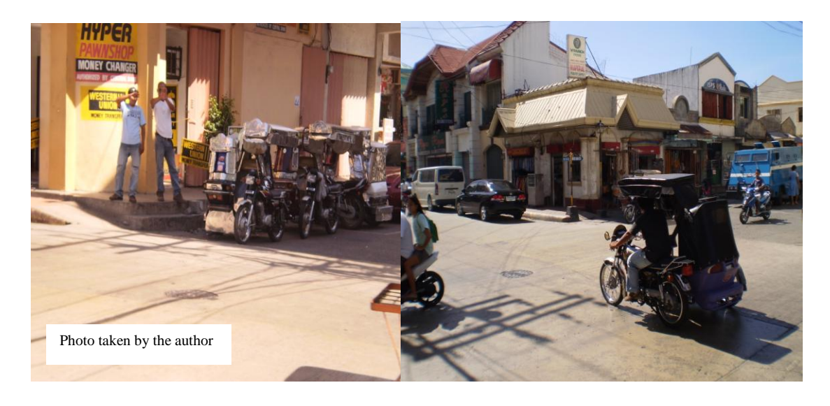
Figure 5 Vehicles are parked near the intersection which is within 6 meters from the intersection

Figure 4 . Vehicles parked at the eastern part of Ouezon Avenue