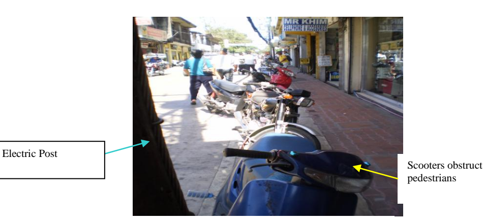
Figure 4 . Vehicles parked at the eastern part of Ouezon Avenue

In is noticed in Figure 4 that vehicles occupy the sidewalks which obstruct the way for the pedestrians. Figure 5 also shows that vehicles do not follow the traffic rules which prohibit drivers to park their vehicles within 6 meters from the section as stated in Republic Act 4136 and the provision in the Traffic Code of Vigan City. Likewise some vehicles are parked near or within the "No Parking" traffic signs.