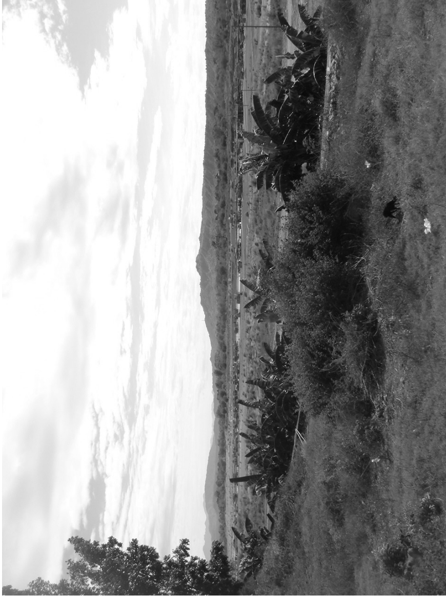
Figure 2. The Laoag Valley near Sarrat: Was this broad and flat expanse of alluvium part of an extensive estuarine inlet during the Middle Holocene?