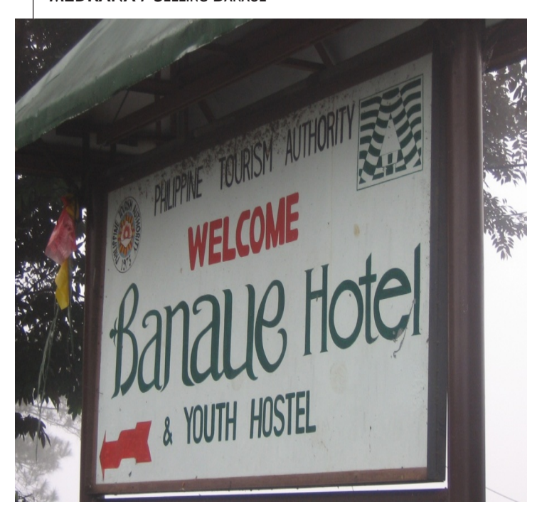
Fig. 5: The sign showing the entrance to Banaue Hotel and Youth Hostel.

sizeable establishments that offer something to tourists. The third road segment branching from the intersection is the major road to Banaue poblacion, which connects to the national highway. This is the one taken by visitors from Manila or from the Mountain Province going to or leaving Banaue, and is also lined with some lodges, inns, small shops, and canteens. The access to the Banaue Hotel and Youth Hostel is through this road (fig. 5). Along the mentioned stretches of the three road segments, names and nature of business establishments catering to tourism are signified on wooden or metal boards.