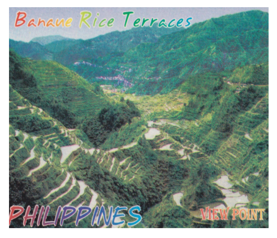
Fig. 3: A postcard showing rice terraces around Viewpoint.

Postcards reinforce the dominant position of Banaue's terraced landscapes, showing it as "dwarfing" the town. They are one good medium in which to build and perpetuate Urry's tourist gaze in the visual dimension. The terraces are blown even larger than their large image in life, multiplied, and interpreted in a postcard.. Aside from the seen, a constellation of other sensed elements could comprise a Banaue in which the tourist could indulge himself or herself: the continuous sound of rushing water from a stream or rice field