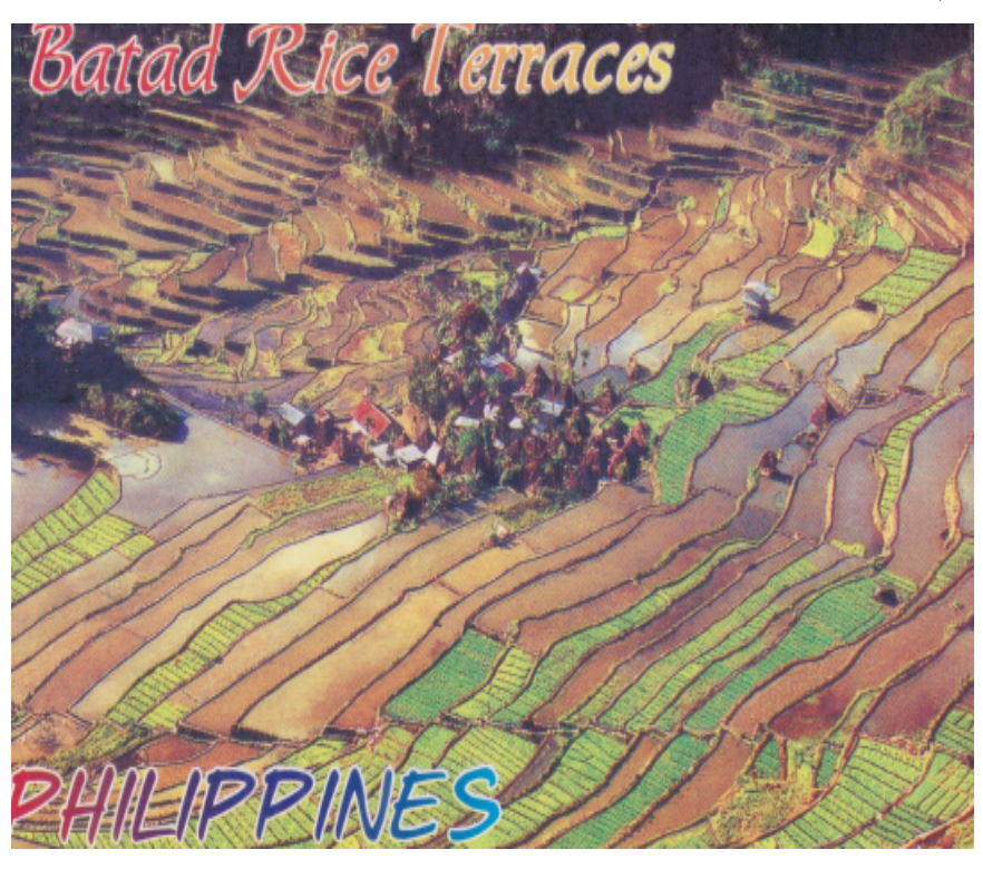
Fig. 2: A postcard showing the Batad Rice Terraces.

center of the frame are the clustered houses of Batad with their clumps of trees that include several betel trees. The whole landscape of rice fields, shaped gigantic as a amphitheater, encloses this tiny of residential enclave structures. On another postcard is a shot of what a visitor could see from the perspective of Viewpoint looking towards the poblacion, or town center (fig.3). Although placed almost at the center of the frame, the poblacion is more of a background than the main subject. The rice terraces are the ones in the foreground and at the left and right sides of the photograph.