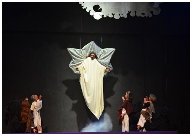
Figure 10. Ascension of Christ

Despite the foreign origins, the company has already created an assemblage of tradition that may now be considered a part of Philippine puppet culture. In the case of Teatrong Mulat, puppets inspired by the bunraku tradition are also manipulated not only by males but also by female puppeteers. In Papet Pasyon , most puppets are bunraku -inspired. Female characters (e.g. Mary and Mary Magdalene) are usually manipulated by female puppeteers while male characters (e.g. Jesus and his apostles) are manipulated by male puppeteers. However, there are also female puppeteers who manipulate male puppets (e.g. Jesus and