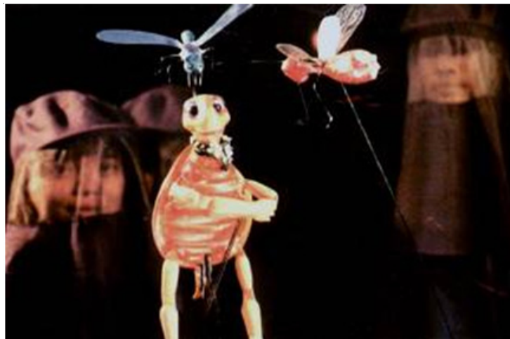
Figure 2. Puppets from Ang Paghuhukom ("The Trial,")

Teatrong Mulat also uses shadow puppets inspired by the wayang kulit of Indonesia and Malaysia. Traditional wayang kulit puppets are made from leather with both sides painted using vegetable oils. Examples of wayang kulit -inspired puppets are those used in Ang Pagbibilang ng Buwaya (1983, The Counting of the Crocodiles)