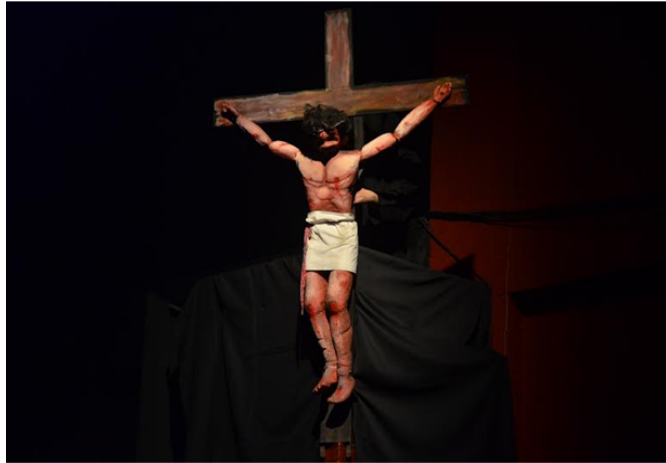
Figure 9. Crucified Christ