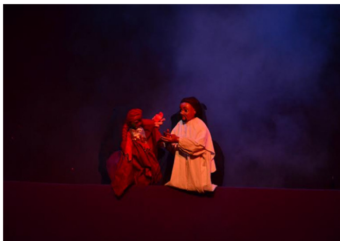
Figure 8. Temptation of Christ in the Garden of Gethsemane

“Biernes Santo” (Good Friday) is the next act and the climax of Papet Pasyon . As earlier noted, Jesus Christ is believed to have died on a Good Friday. This death symbolizes how humankind is saved from sin. In the puppet performance, Carol Castro’s crucified Christ is shown to audience members, accompanied by sounds of thunder (See Figure 9). Lights are dimmed and a lavender-colored spotlight illuminates the sculpture in a dramatic temperament. At the end of this act, there is a short silence before the child narrator reappears to sum up the different events leading to Christ’s death and to introduce the next and final act: “Linggo ng Pagkabuhay” (Easter Sunday).