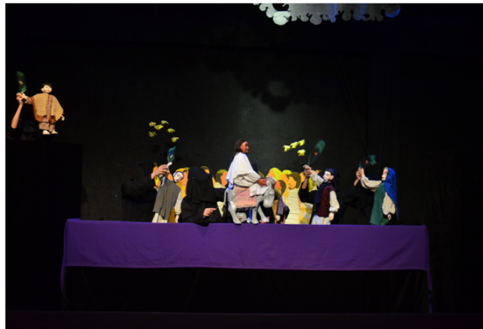
Figure 4. Jesus' Entry to Jerusalem

But then this child-narrator remembers something upon seeing Domingo de Ramos flashed on a white screen downstage right. He slowly reads the words projected and begins singing the song "Pagsalubong kay Hesus" (Jesus is Welcomed). In this sense, the first act is primarily the victorious entrance of Jesus in Jerusalem, which, in the Gospels and in popular pasyon , is the beginning of the passion narrative (See Figure 4).