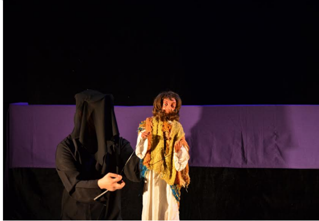
Figure 6. Judas

The next act, "Huwebes Santo" (Maundy Thursday), Lapeña-Bonifacio squeezed three important events in the passion narrative in ten minutes: the Last Supper (See Figure 7), the garden of Gethsemane (See Figure 8), and the capture of Christ. A highlight of this act is the appearance of the huge devil puppet, which tempts Christ during the prayer in Gethsemane to be saved from the call of the cross.