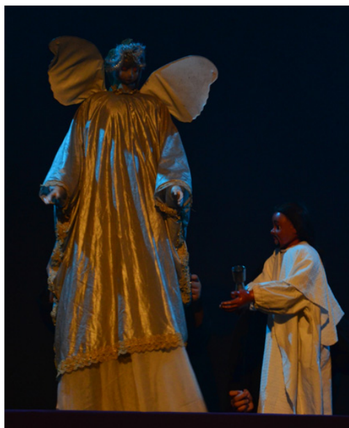
Figure 3. Angel with Jesus Christ from Papet Pasyon

and Si Arao at si Bulan (1983, Sun and Moon). In these plays, puppets were painted on a plastic sheet using acrylic paint. The cut-outs were then supported using umbrella rods. With the use of translucent material, the colors came out easily on the screen.