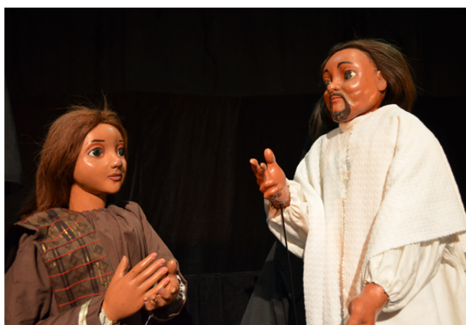
Figure 5. Magdalena

In the second act, “Lunes Santo” (Holy Monday), the same child introduces the very first encounter of Jesus with the high priests. The child narrates that this encounter was due to the uncontrolled temper that Jesus had when he saw the temple transformed into a market place. The third act is titled “Martes Santo” (Holy Tuesday). As in the previous acts, the title is also flashed onscreen. Like other sinakulos , the introduction of Mary Magdalene is a very important aspect of the narrative (See Figure 5). Following the story in the Gospels, Mary Magdalene is introduced as the adulteress. In this performance, Mary Magdalene is introduced as a sinner. This, perhaps, is due to the fact that the audience is mostly children. But what is important in this act is the presentation of the transformation of Magdalene from a sinner to a disciple. From here onwards, Mary Magdalene is seen to be one of the chosen few of Jesus, similar to the dramatizations presented in many sinakulos .