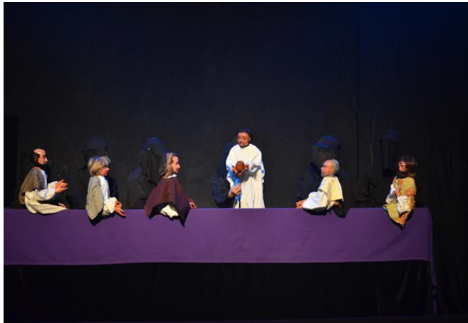
Figure 7. Last Supper

The next act, "Huwebes Santo" (Maundy Thursday), Lapeña-Bonifacio squeezed three important events in the passion narrative in ten minutes: the Last Supper (See Figure 7), the garden of Gethsemane (See Figure 8), and the capture of Christ. A highlight of this act is the appearance of the huge devil puppet, which tempts Christ during the prayer in Gethsemane to be saved from the call of the cross.