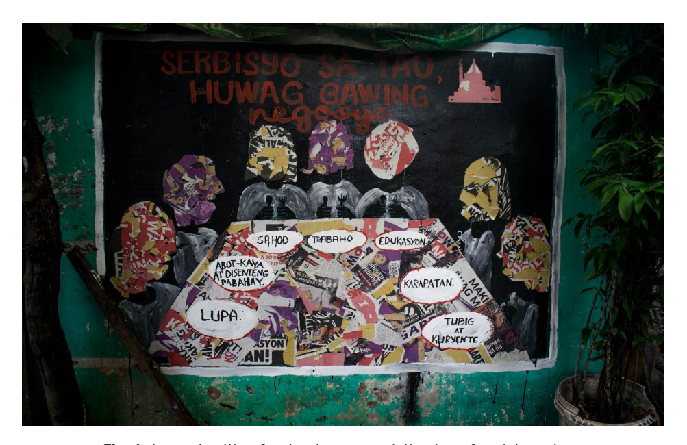
Fig. 4. A mural calling for the decommercialization of social services.