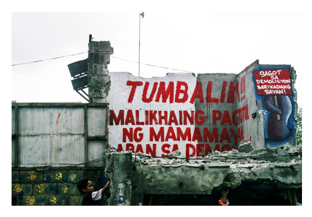
Fig. 2. The mural reads "Tumbalik!!!" Also on the right is the image of a protest placard saying "Sagot sa demolisyon, barikadang bayan!" ("The solution to demolition? The people's barricade!").

Other murals draw elements from other spheres of experience, revealing intersections among the urban poor and other sectors. With the influence of KADAMAY, some of the residents adopted the comprehensive call "lupa, sahod, trabaho, at karapatan" ("land, wages, jobs, and rights") of the workers' movement, imbuing the campaign with their own calls such as housing, water, and electricity (figs. 3 and 4). While figure 3 directly presents the campaign, figure 4 takes a satirical approach: the democratic rights forwarded by the locals (now including water, electricity, and affordable housing) are on the dinnertable of several defaced figures while a slogan hangs above saying "Serbisyo sa tao, huwag gawing negosyo" ("Services for people shouldn't be made into business").