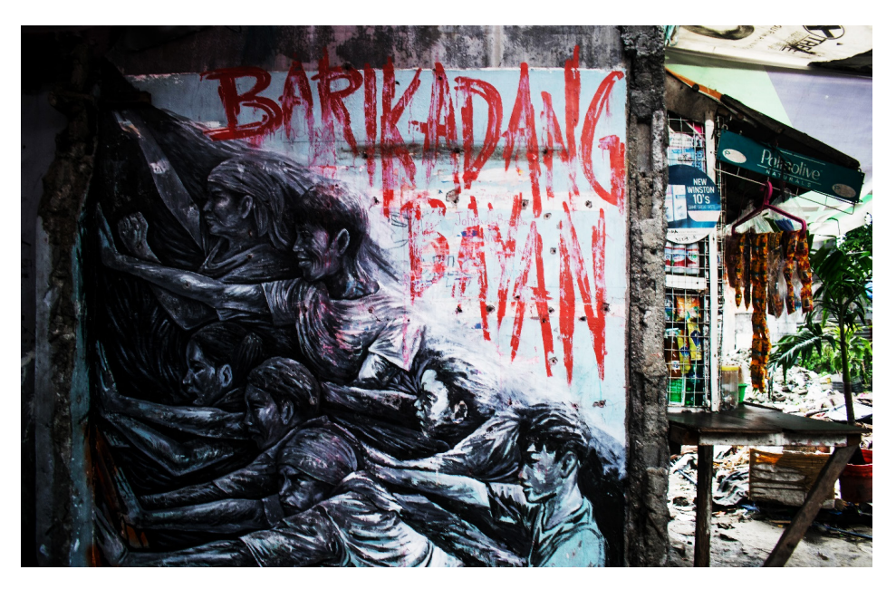
Fig. 6. The figures in the mural support a barricade against a demolition team.