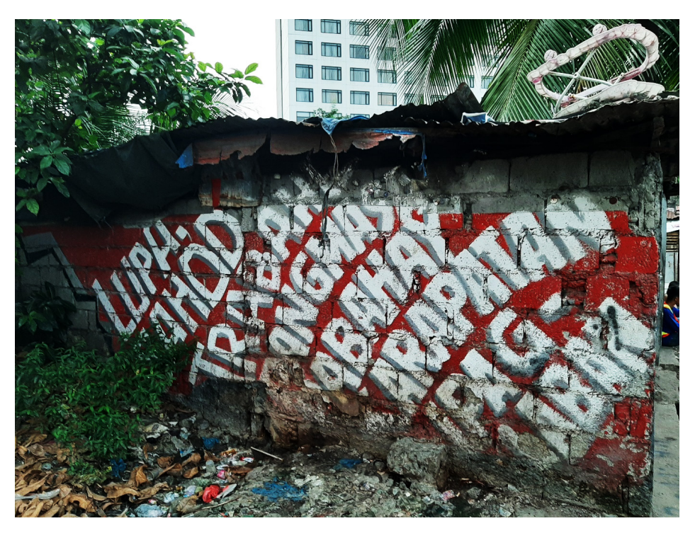
Fig. 3. A comprehensive campaign for democratic rights tagged on a resident's house.