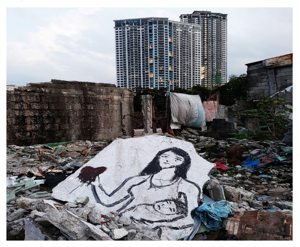
Fig. 10. Demolishers have already ravaged this area of Sitio San Roque. However, an image of a mother and child symbolizing the campaign "Nasa Puso ang San Roque" survived the wrecking ball.

artwork. Guazon's comment on public art resonates with this experience: "art's relevance endures in moments and spaces where introspection and scrutiny are possible, and when reflection finds fruition in action" (869). By provoking a break in perception, San Roque's community of sense discloses links among the residents' desires in/for the city that are absent in the state's planning. Interestingly, a portrait of a mother carrying a child and a heart—formerly a part of a bigger mural—survived demolition (fig. 10). I surmise that demolishers who saw this despondent portrait felt discomfort in their actions. In this way, I read the mural's survival as a breakage away from the visual codes of "development."