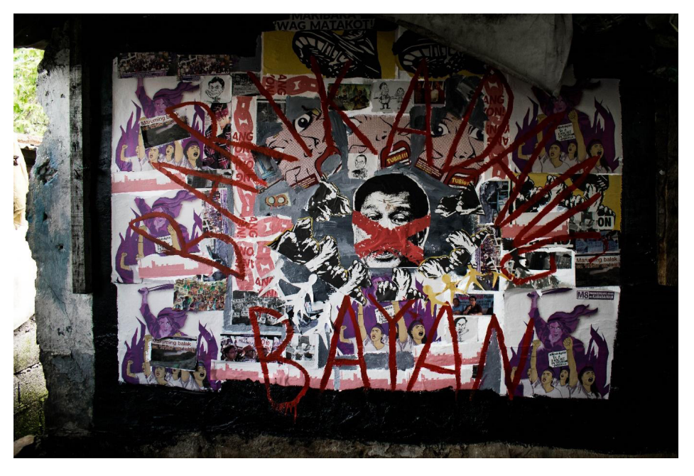
Fig. 7. A collage featuring a crossed-out cutout of Duterte's face.