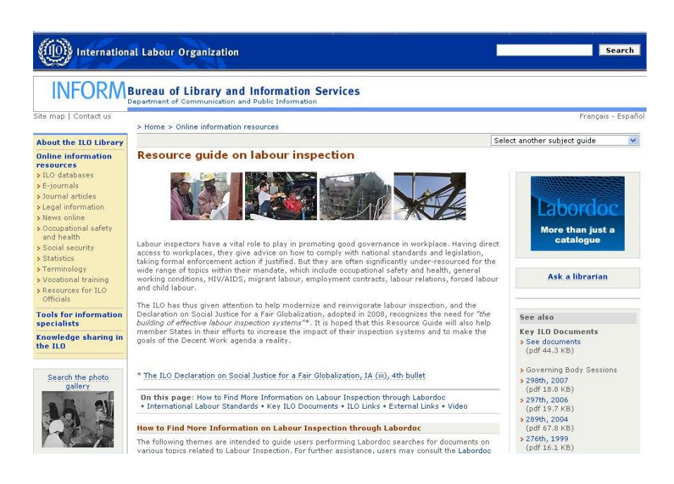
Figure 2. Resource guide on labour inspection (English)

http://www.ilo.org/public/english/support/lib/resource/subject/labourinsp.htm