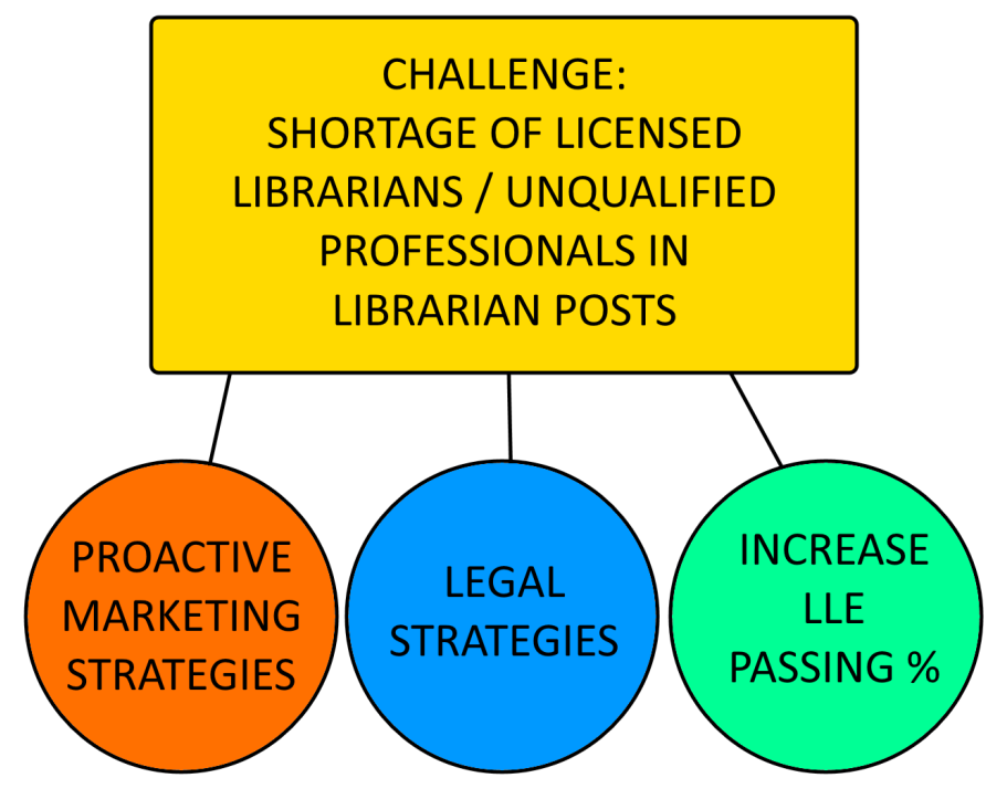
Figure 3. Strategies to Remedy the Shortage of Licensed Librarians