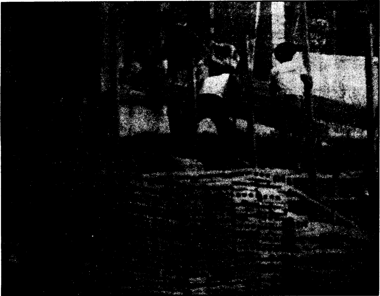
RP's cheap labor: its comparative advantage?