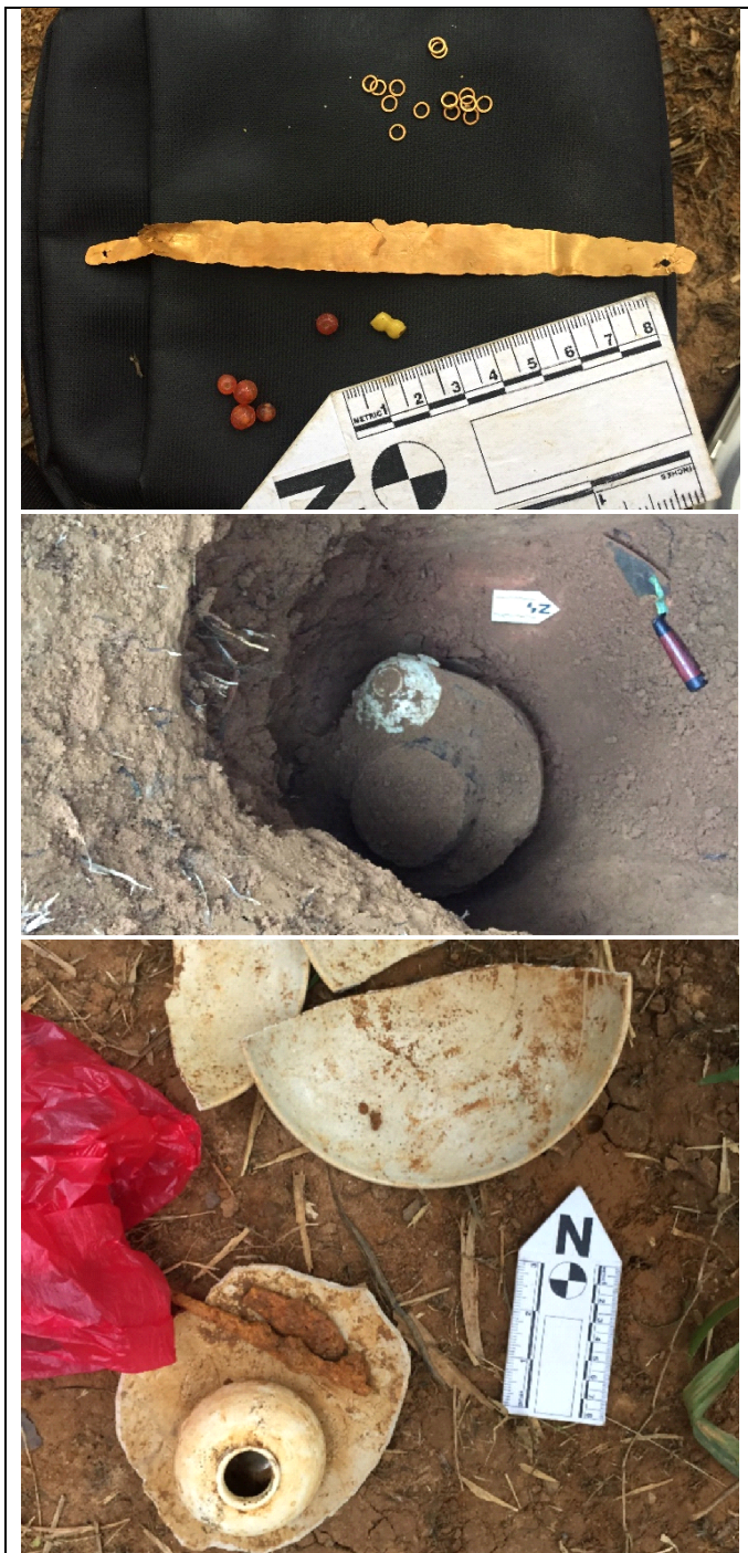
Figure 4. Photographs of the gold beads and strip, and other materials recovered by the diggers (top); dig showing a large earthenware jar (middle); and tradeware ceramics accompanying the jar (bottom).