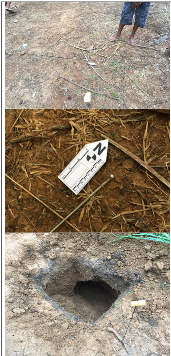
Figure 3. Photographs of a sonda used to test lands for buried cultural materials (top); a sonda 's rounded head in a close-up (middle), and a guna , a small knife used for slow and careful digging, next to a sonda still stuck on the ground (bottom). Photos by the author, 2017.