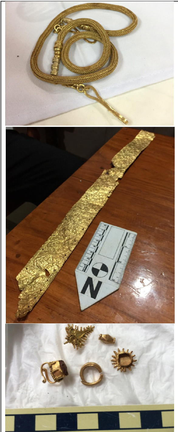
Figure 5. Photographs of a 35-gram gold chain offered by Financier A to Collector B for PHP 500,000 and haggled down to PHP 350,000 (top); a 21-gram gold head piece owned by Collector A and offered to Collector B for an undisclosed amount (middle); and gold ear ornaments, weighing a total of 6 grams, offered for an undisclosed amount to Collector B (bottom).