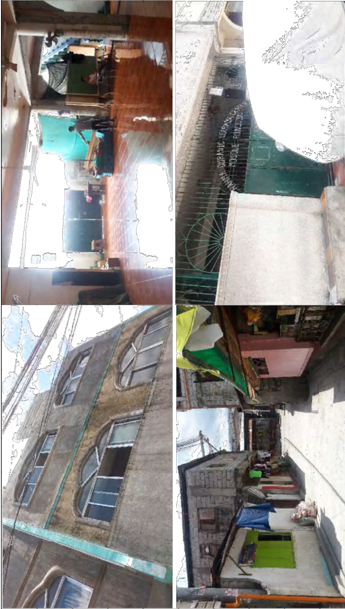
Figure 6. The Rahma Masjed. Above left, the mosque's facade, viewed from street; above right, interior, the first floor of Rahma Masjed; below left, Cotabato Street viewed from the mosque's gate; and below right, the gate to the Rahma Qur'anic Learning Center.