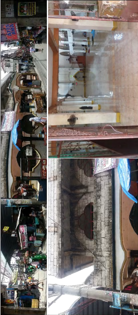
Figure 3. Al Salam Mosque. Above, a view of Libyan Street across Al Salam Mosque; below left, the second floor; below right, the first floor.