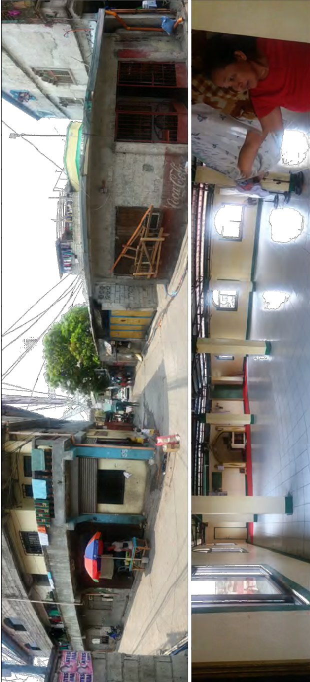
Figure 7. The Mohammadiyyah Mosque on Libyan corner Mujahideen Street. Above, the mosque is on the third floor of the building on the left, the entrance is behind the colored umbrella. Below, interior of the mosque.