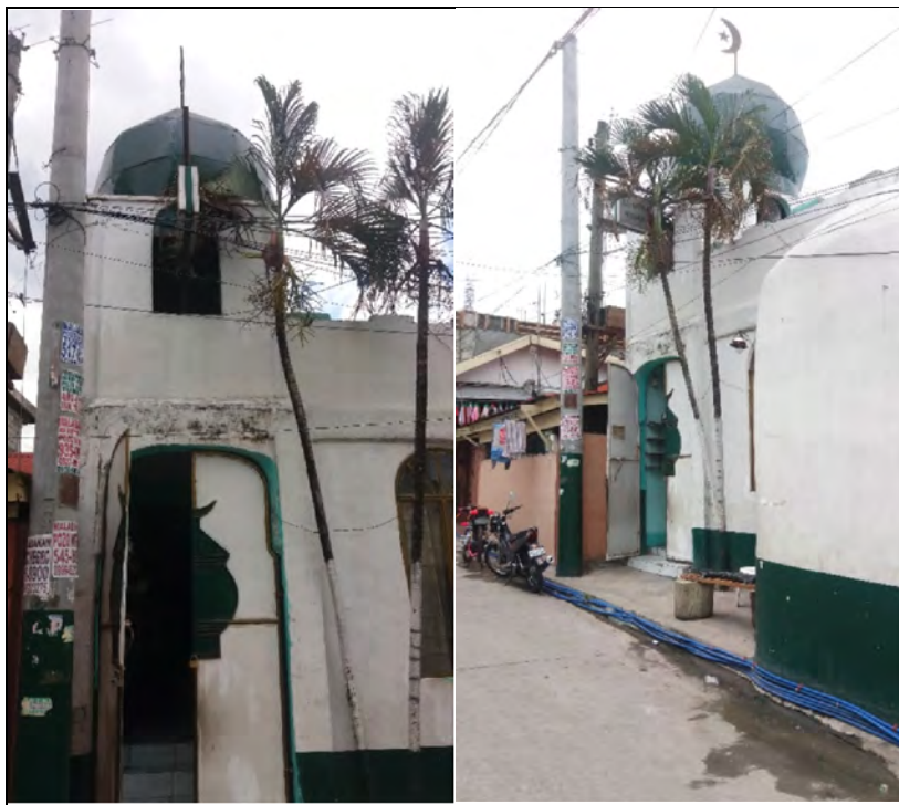
Figure 4. Front view and side view of the Al Ahbrar Mosque.