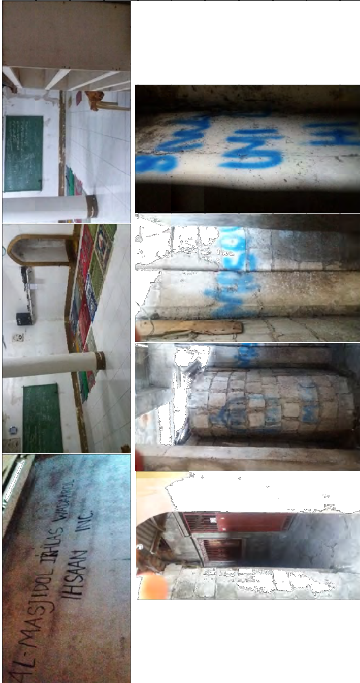
Figure 5. Al Ihklas Mosque. Above left, sign on the steel door; above center, the minrab and mats, interior; above right, shoe rack and blackboard at the entrance. Below, the corridor leading to the mosque.