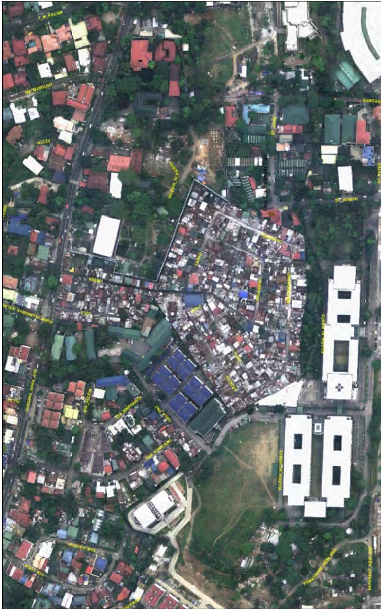
Figure 2. Satellite view of Al Salam Mosque Compound from Google Map.