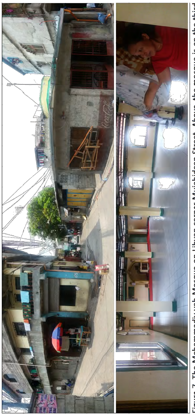
floor of the building on the left, the entrance is behind the colored umbrella. Below, interior of the mosque. Photos Figure 7. The Mohammadiy-yah Mosque on Libyan corner Mujahideen Street. Above, the mosque is on the third by author, 2016.