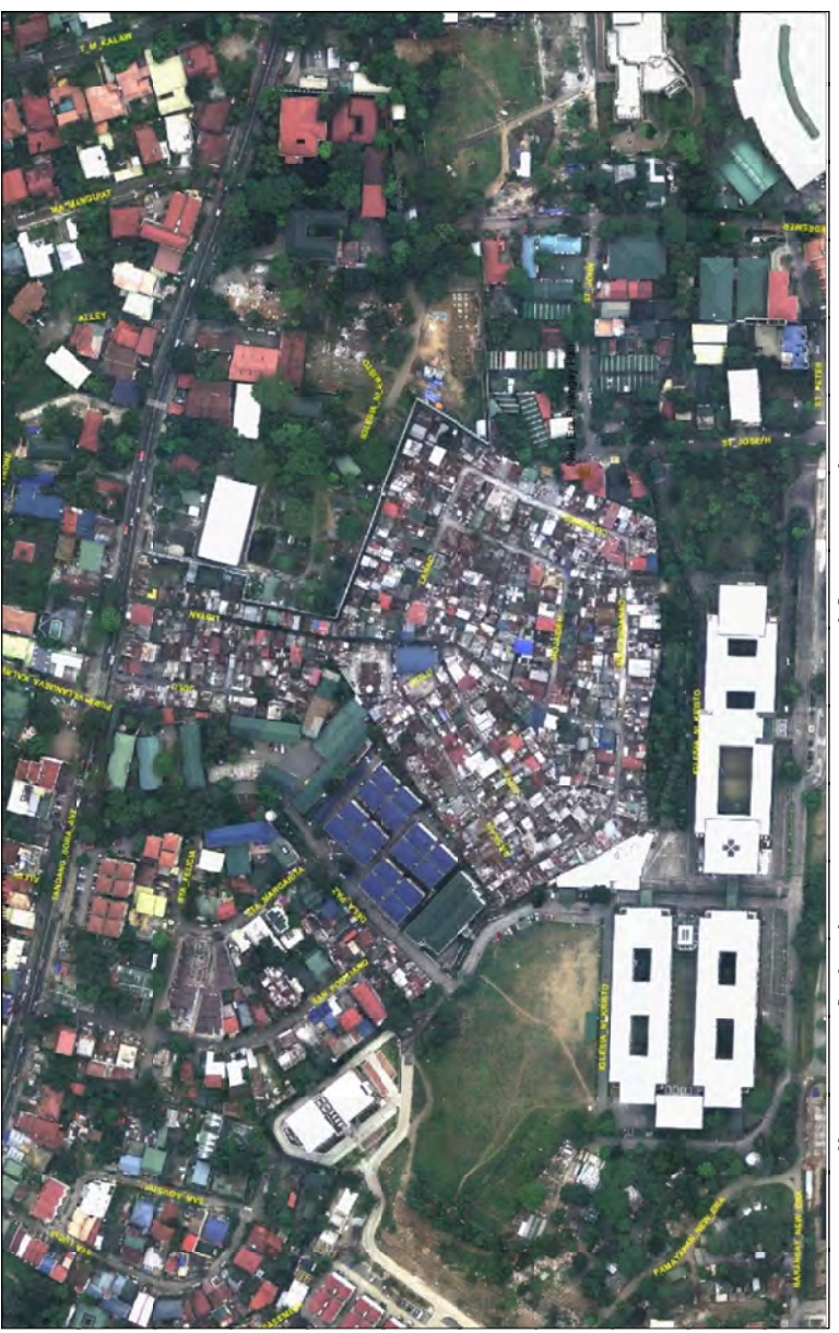
Figure 2. Satellite view of Al Salam Mosque Compound from Google Map.