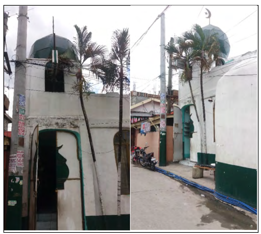
Figure 4. Front view and side view of the Al Ahbrar Mosque.