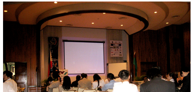
13th Inter-University Seminar on Asian Megacities (UP, March 2008)

During the Centennial Year 2008, the UPCA was intensively involved in efforts leading toward this environmental imperative. Our Alumni Homecoming on March 7, 2008 heralded our formal announcement of our goal. The annual "Haraya" last March 2008 manifested this environmental focus in the exhibition of works of students and faculty and lectures. On the same month, the UPCA hosted the 13th Inter-University Seminar on Asian Megacities, with the theme: "Asian Megacities, the next 100 years...Environmental Challenges to Architecture and Planning". Participants from leading universities in Asia converged on UP to present papers and researches on this theme. This jumpstarted future research collaborations, academic linkages and faculty-student exchanges with the foremost institutions in China, Japan, Korea, Hong Kong, Taiwan and Thailand.