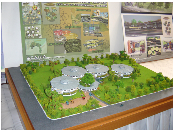
Architectural thesis exhibited in Haraya 2008

"Green Architecture", "Sustainable Design" have insinuated themselves into the consciousness and interests of our profession in 'recent' years. The terms as well as the substance behind them have been used, as well as abused to no end. As global warming and environmental upheaval transition from science fiction to science fact, and as more and more attention is focused on architecture and design, we are besieged by the challenge and responsibility to sift through the rhetoric, and arrive at substantive approaches to insure that our architecture is truly environmentally sound. Easier said than done. As fast as "green architecture" becomes a marketing tool and catch phrase...the number of "foremost proponents of Green Architecture" increase exponentially.