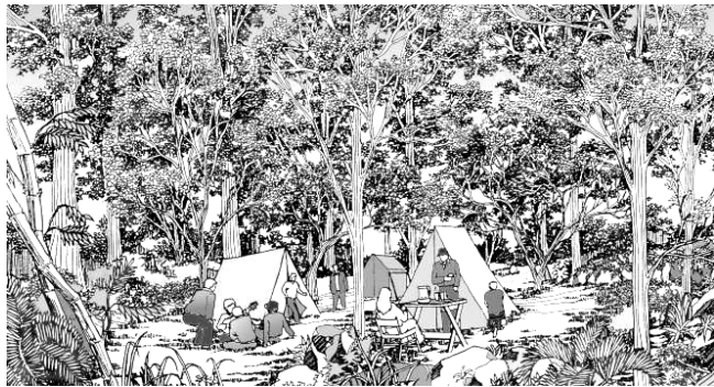
Proposed Camp Site at Calauit Island

Tomeldan presents both a graphic and analytic demonstration of comprehensive development planning processes applicable to tourism sites in Tourism Structure Plan of Busuanga and Coron, Northern Palawan . He stresses the importance of tourism master plan in national development and the role of sustainable environmental management in tourism planning.