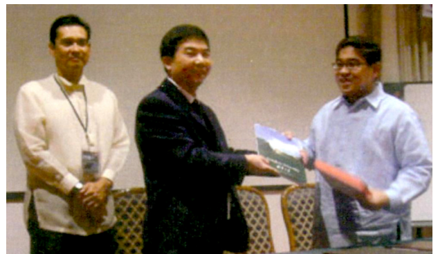
Inter-university collaboration of UP and Tsinghua University

A continuing series of lectures is held at the UP College of Architecture. One was on the LEED (Leadership in Energy and Environmental Design) evaluation system developed by the US Green Building Council by a LEED Accredited Professional. In this and the coming lectures, the aim will be to cut to the core.