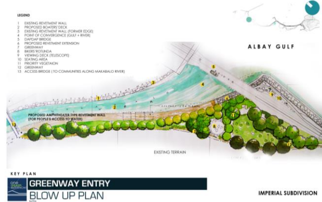
Figures 3 to 6. Blow-up plans of various areas within the proposed waterfront development. (Images rendered by author)