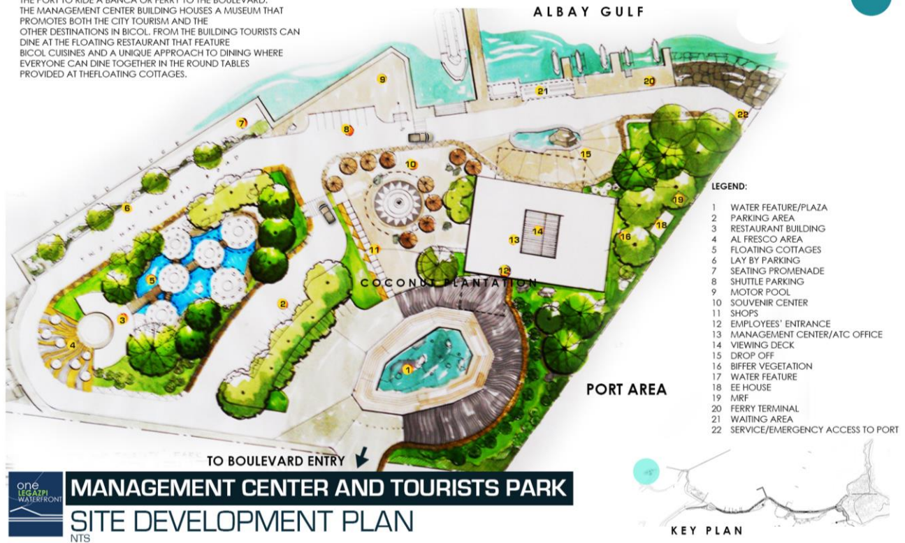
Figure 2. Proposed Site Development Plan of Management Center and Tourists Park. (Image rendered by author)

THIS IS THE PARK WHERE TOURISTS ARE BROUGHT FROM THE PORT TO RIDE A BANCA OR FERRY TO THE BOULEVARD. THE MANAGEMENT CENTER BUILDING HOUSES A MUSEUM THAT PROMOTES BOTH THE CITY TOURISM AND THE OTHER DESTINATIONS IN BICOL. FROM THE BUILDING TOURISTS CAN DINE AT THE FLOATING RESTAURANT THAT FEATURE BICOL CUISINES AND A UNIQUE APPROACH TO DINING WHERE EVERYONE CAN DINE TOGETHER IN THE ROUND TABLES PROVIDED AT THE FLOATING COTTAGES.