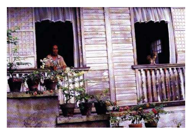
Figure 1 - Visual tangible qualities like color & texture