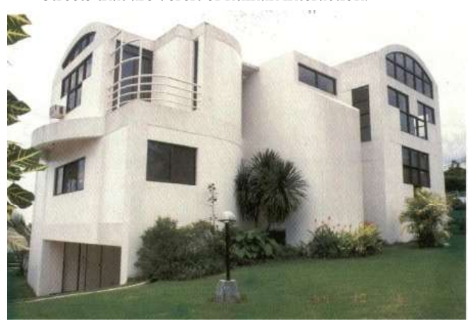
Figure 4 — indoor spaces that do not connect to the hardin