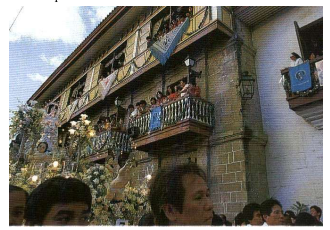
Figure 3 - The Typical Filipino Balcony

where the family members avail of an afternoon breeze, or take a nap without feeling too exposed. When inside this space, it is understood by all that there is no need to get into the more private sala .