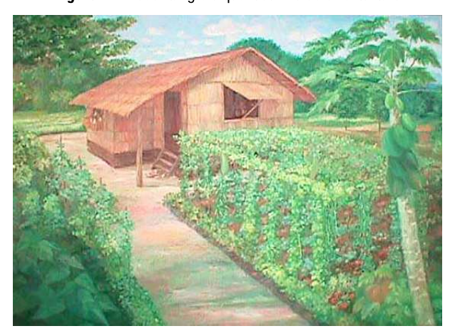
Figure 2 - The manner they are arranged in landscape

A second important physical dimension prevalent in cultural landscapes is the enclosure. This is especially characteristic of Islam and Oriental cultures, as evident in the Alhambra Palace, Spain's finest example of Moorish architecture, as well as in many Persian, Indian and other middle-eastern cultures. High-walled gardens and cities often give no indication of the vibrant array of fragrant flowers and plants and tiled courts and air-cooling fountains and pools that lie beyond their elaborate gateways. It is interesting to note that the word "paradise" is derived from the ancient Persian word pairidaeza meaning park or enclosure.