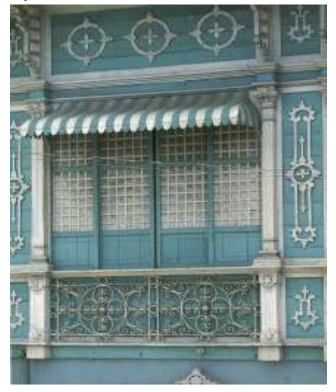
Figure 4 - the landscape patterns

But, to be sure, when we have mastered our language of ornamentation and our palette of patterns, perhaps we will be able to redesign the Christmas look of Ayala Avenue and Roxas Boulevard to reflect a more Filipino culture; when we begin to adorn our pavements, banners, lampposts, and walls and enclosures of our cities and neighborhood using the banig patterns, the sampaguita blossoms, the tinalak weave, then we will have contributed to the propagation of Filipino culture.