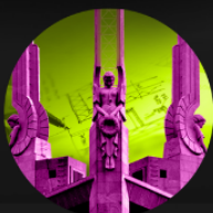
History, Theory, and Criticism