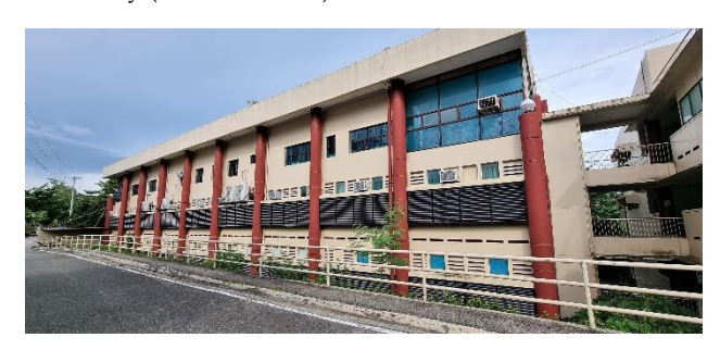
Figure 9. Nursing Building, Holy Name Unversity, Tagbilaran City