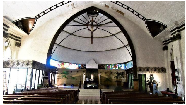
Figure 2. An artificial cave. Sanctuary of Downtown Campus Chapel, University of San Carlos, Cebu City

Even the design activity behind amorphous, sometimes artificial hill-like forms is unique. He does not add up volumes to create a "building" but removes, "hollows out," spaces.