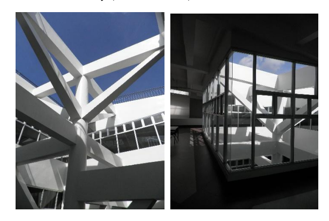
Figure 7.,8. Details Joseph Baumgartner Learning Resurce Center, Talamban Campus, University of San Carlos, Cebu City