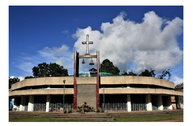
Figure 4. Bunawan Church, Agusan de Sur, His first work