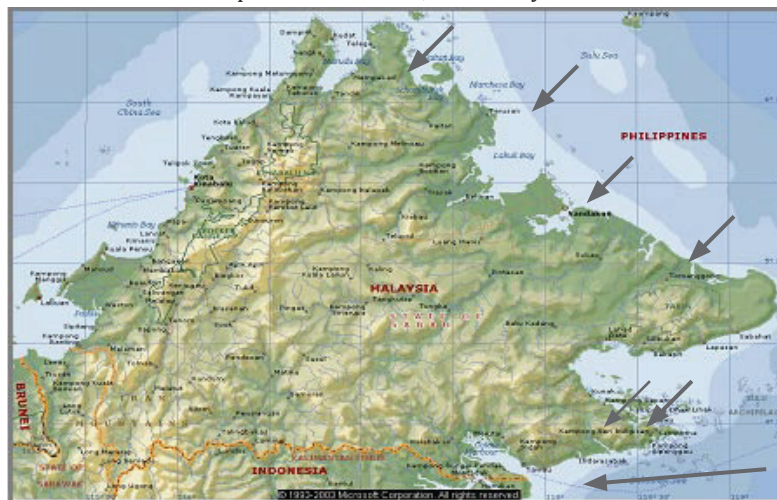
Map 1. State of Sabah, East Malaysia

Key: —> Flow of transmigrations to the eastern coast of Sabah