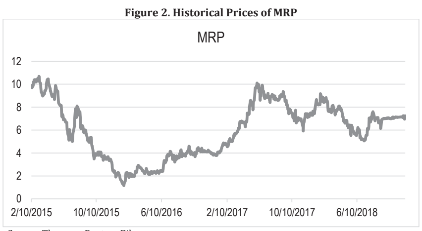
Figure 2 shows the historical share price of MRP.