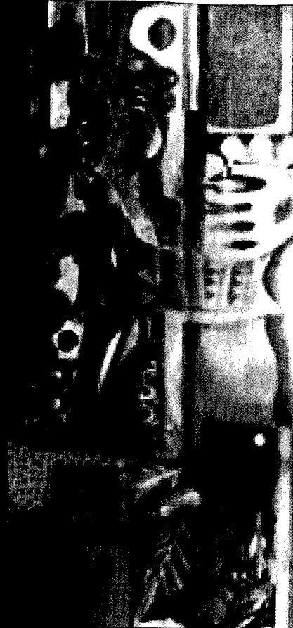
"Ani sa Tag-araw" 19.5" x 9.5" Mixed media

Babae... sa tag-ulan at tag-araw Patuloy mong mahal in ikaw Tibok ng pusong sumasayaw Pagmamahal sa kapwa ay isigaw