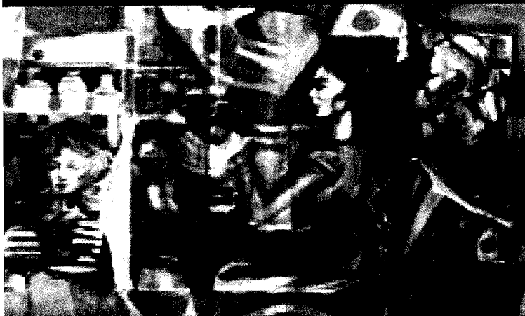
"Ikot ng Banga" 18" x 30" Mixed media

Woman... through the seasons, rain and sun, Never cease to love yourself To the beat of your dancing heart, Proclaim your love of all who share in life.