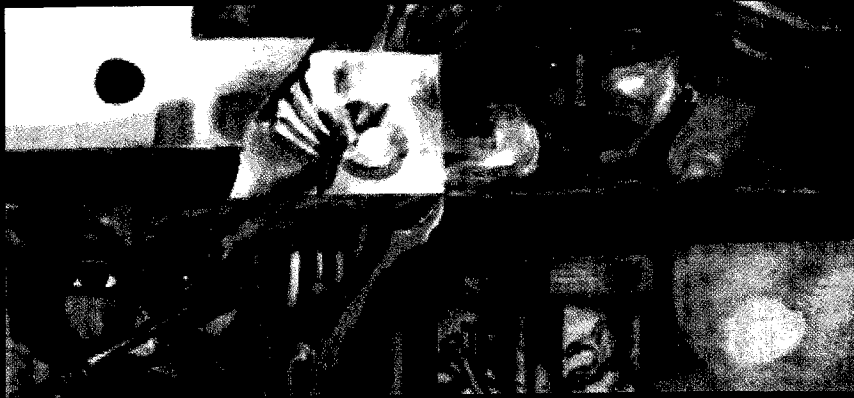
"Salita ay Gawa"