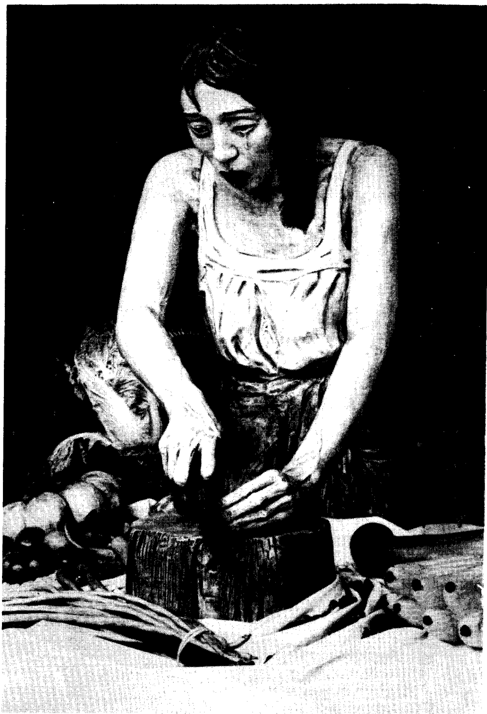
"Cutting Onions Always Makes Me Cry"