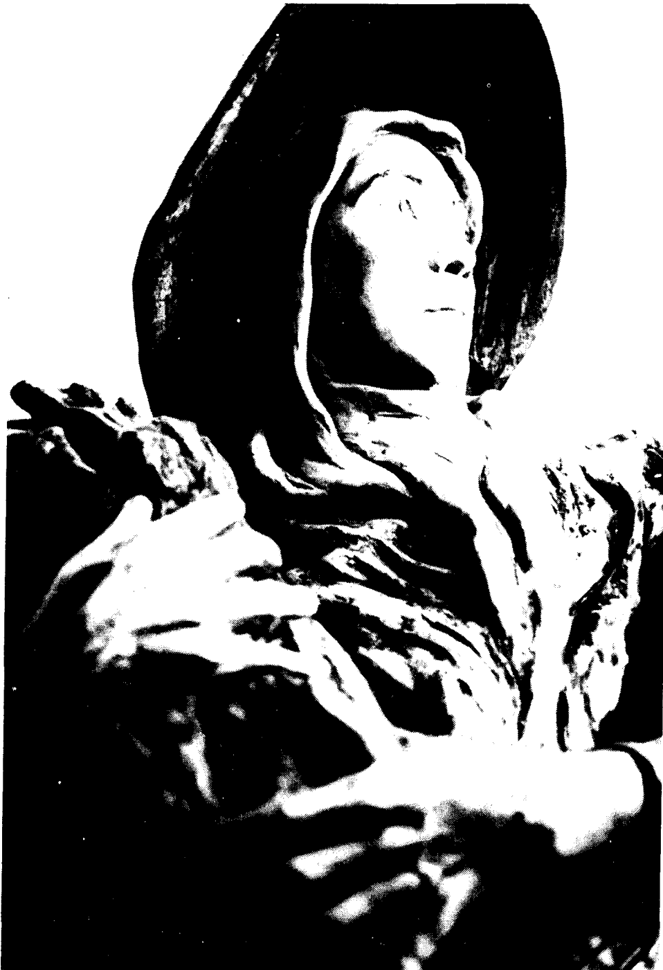
"Peasant Woman" 1990