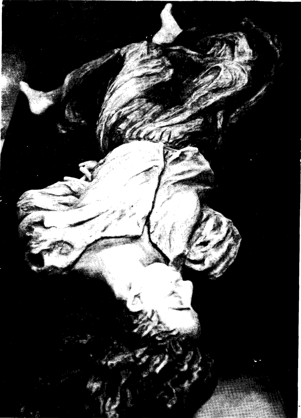
"Death and Doxology"