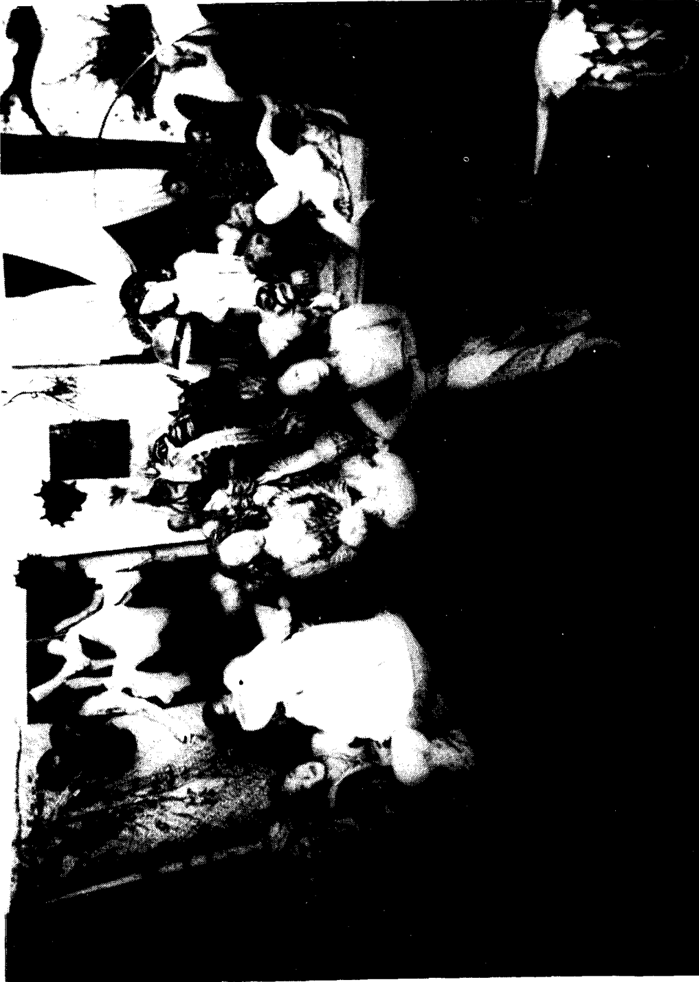
The Artist's Studio in Sta. Maria, Bulacan 1991