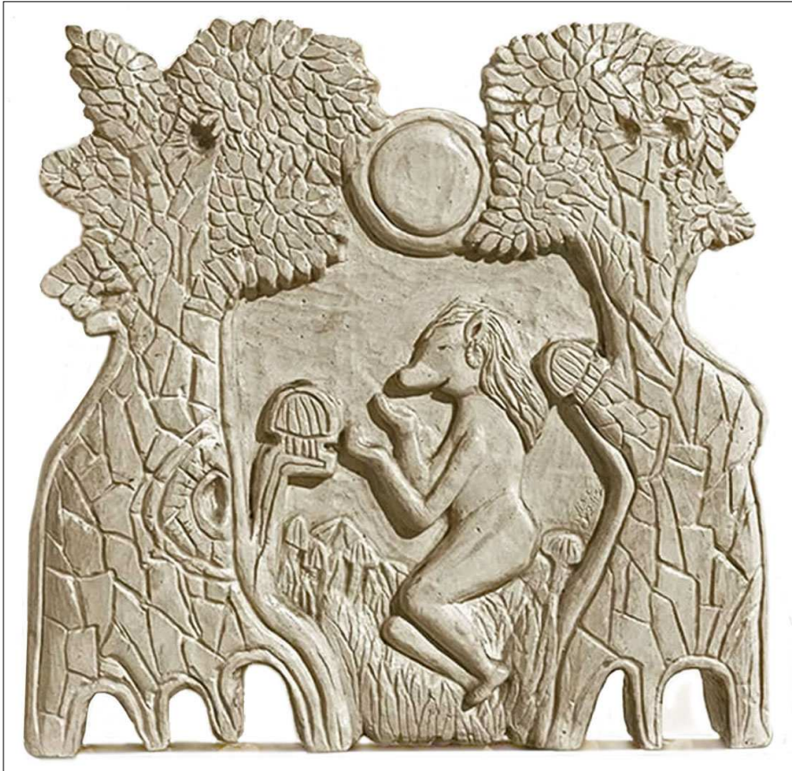
“Bangkilan; Pangalawang yugto ng kahinaan”

Relief sculpture, 38 x 38 x 10 cm plaster