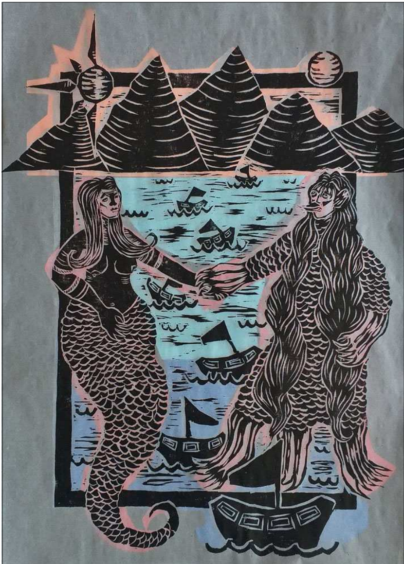
“Aman Sinaya and Amabie; Watashi tachi, hitobito wo mamoru”

Relief print on 40 x 30 cm origami and classic tracing paper