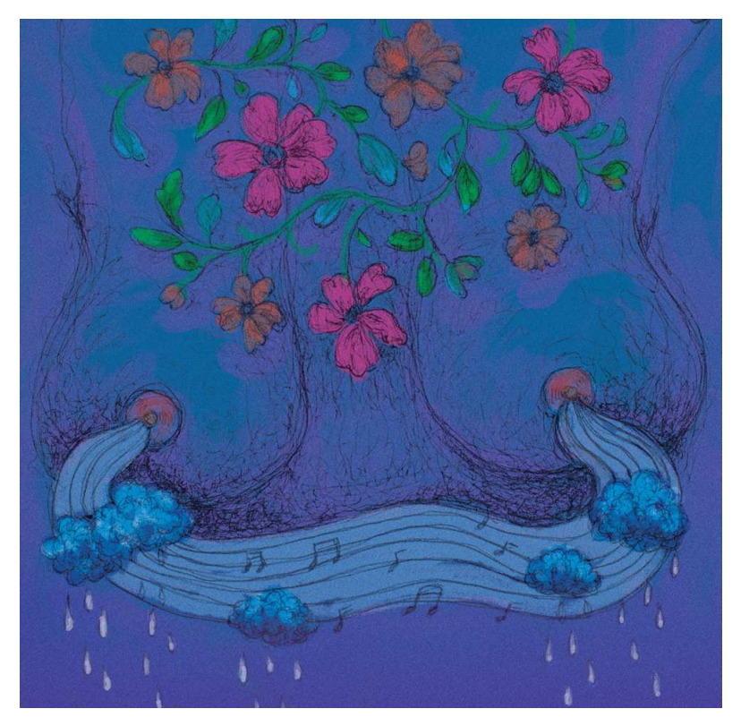
Milk Ballpoint pen and digital painting 9.8" x 9.8"

The body part which is mostly seen with malice by men is more than what is seen. The woman milks for her child. The woman milks dreams, concepts, love. She milks life, and she does it good.