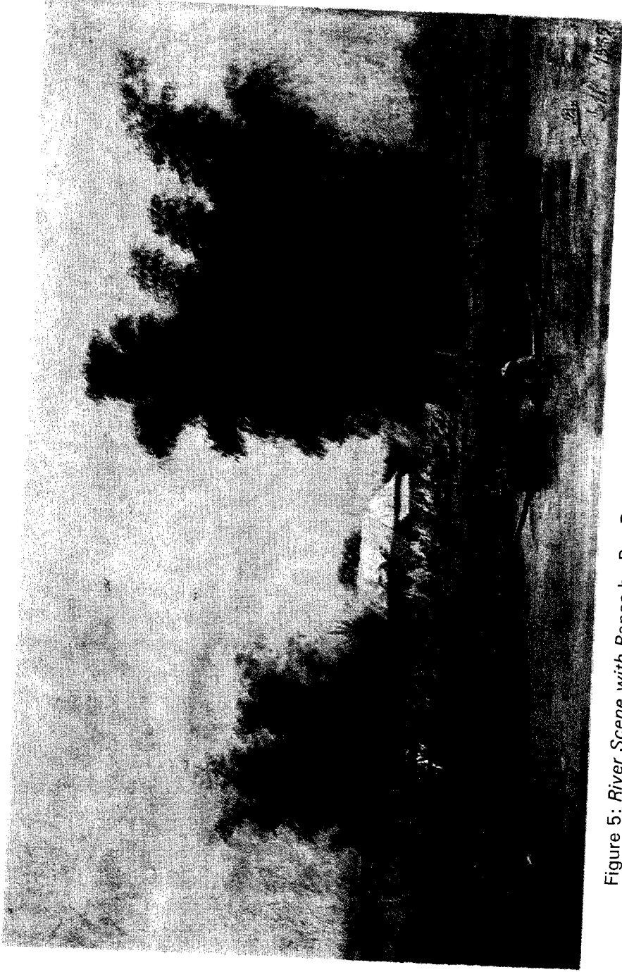
Figure 5: River Scene with Banca by Paz Paterno. Bangko Sentral ng Pilipinas Collection.