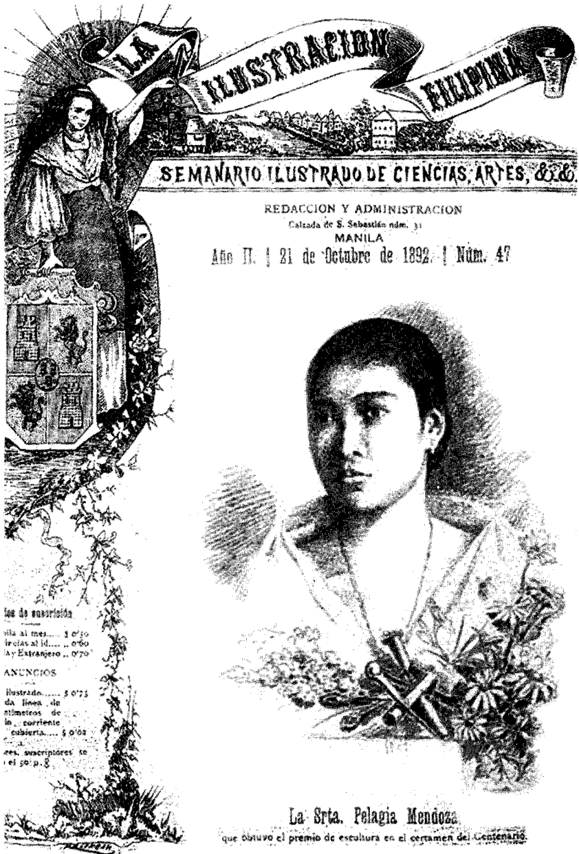
Figure 2: Pelagia Mendoza on the cover of La Ilustracion Filipina .