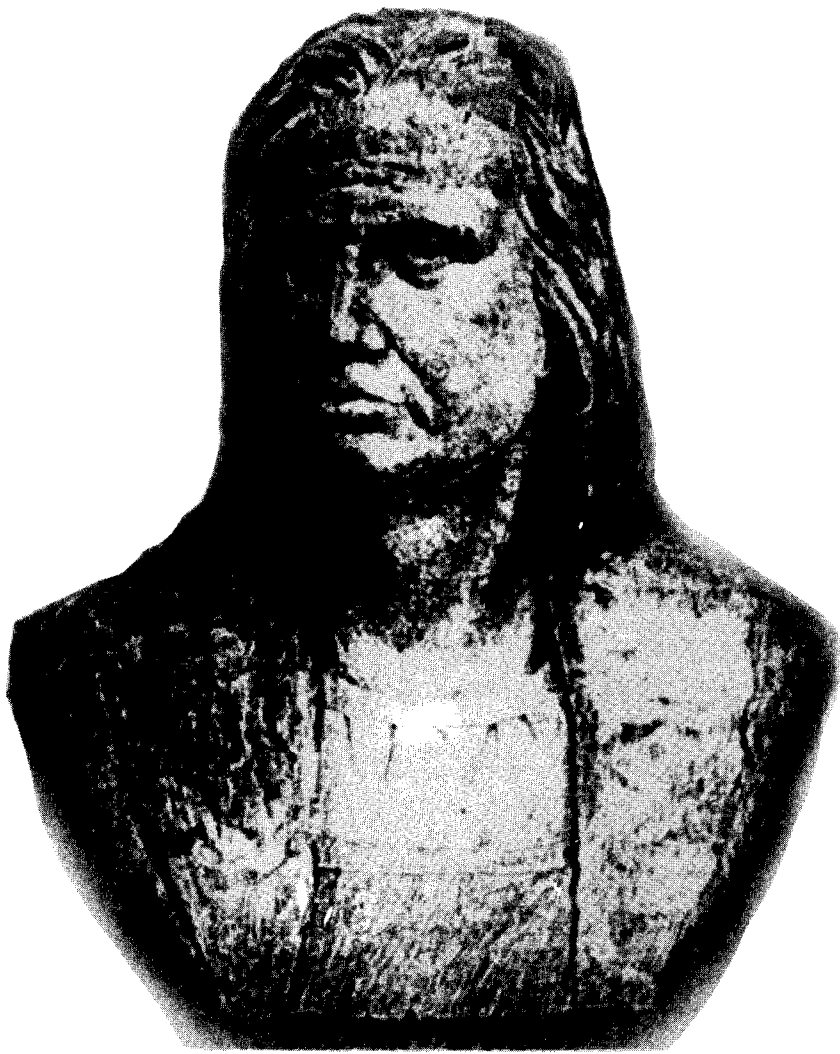
Figure 1: Pelagia Mendoza's Colon .