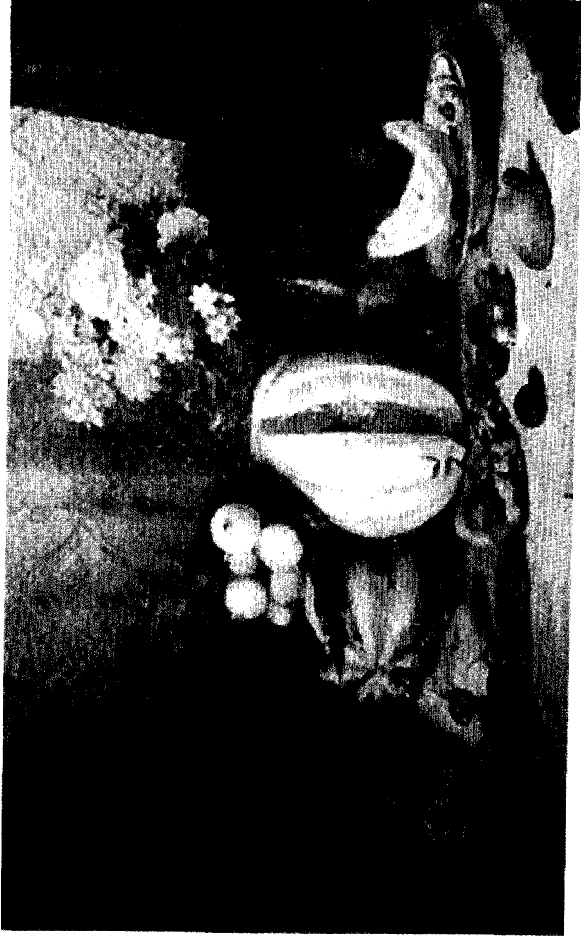
Figure 4: Fruits and Flowers by Paz Paterno. Bangko Sentral ng Pilipinas Collection.