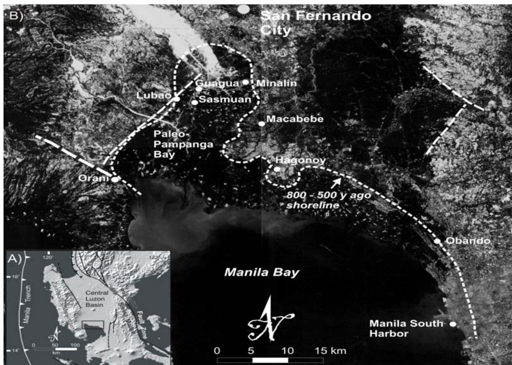
Figure 1 A) Major geologic structures of Central Luzon Basin modified from Maletterre (1989) and Nelson et al., (2000). B) Coastal morphology and local tectonic features

Lineaments in satellite images of the region are most likely active faults that might be responsible for some