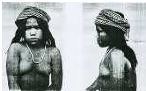
Young Igorrote Woman of Ambuklao, Benguet: Photo from the Report of the Philippine Commission, 1903. Part 2