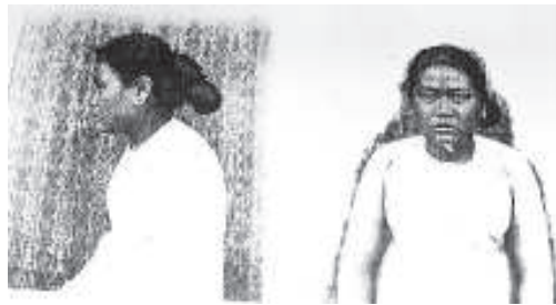
Subanon woman: Photo from the Report of the Philippine Commission, 1903. Part 2

Head and face measurements to be satisfactory must be taken with special calipers, but in the absence of these, some rough measurements can be taken by placing the person's head against a wall and using a square. In such cases, always describe just how your results were obtained and state that they are only approximately accurate.