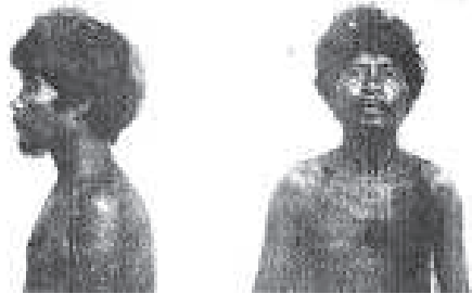
Mangyan man: Photo from the Report of the Philippine Commission, 1903. Part 2

In addition, the flatness or prominence of the nose, as well as the shape and position of the nostrils, should be noted, whether visible from the front or opening downward.