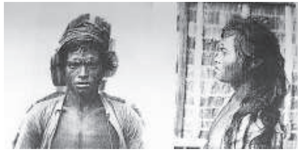
Yakan Moros of Basilan

Likewise, there was a strong interest in documenting art objects, ornamentations, and other cultural artifacts of that sort as these are good indicators of social status.